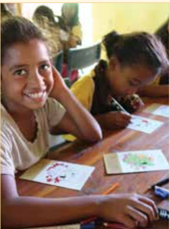
Children happily colour in the cuddly koala sent to them with heartfelt messages from our wonderful donors.