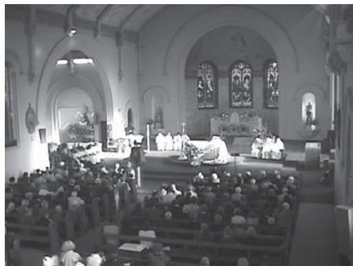
The National Shrine during Mothers' Mass, 18 July 1999