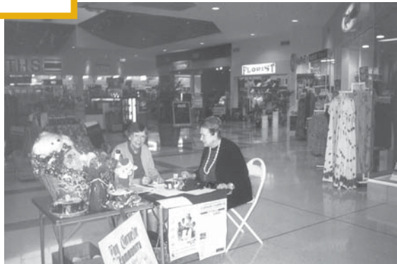
The Bribie Island Lay Carmelite Community members and friends selling raffle tickets to assist our VIIP Fund

They hope to be able to continue their fund-raising this year. The VIIP thank you!