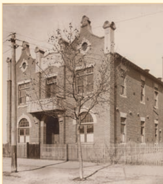
Carmelite Hall 1935. A two-storey brick structure with wooden staircase at the side (c.r.) and a picket fence at front. A tree and a power pole are in front in foreground. Frame verso reads: "Hatherley & Horsfall, decorators, 495 & 497 Burwood Road, Glenferrie.

If you attended a special event or have memories of the Carmelite Hall we would love to hear from you. Contact Fundraising Development Office on 03 9690 8822 or email fundraising@carmelites.org.au