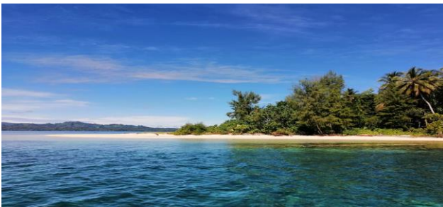
The white sandy beach on Manus Island about 100 metres destroyed by king tide

Growing up in a caring, nurturing Melanesian clan on the beautiful, tropical island of Manus, I can remember a childhood spent in a tranquil environment with vast forests, mountains, and rivers. White sandy beaches, coconut trees swaying over the sand and the blue waters. Lovely birds and an abundance of fish in the sea. In other words, a Paradise on earth. Sadly, over the past two decades, I have experienced the reverse of those two aspirations, social and justice. What we recognise as our social and environmental life has been bombarded with greed, corruption, misuse of power, bias and inequality, racism, environmental pollution and destruction.