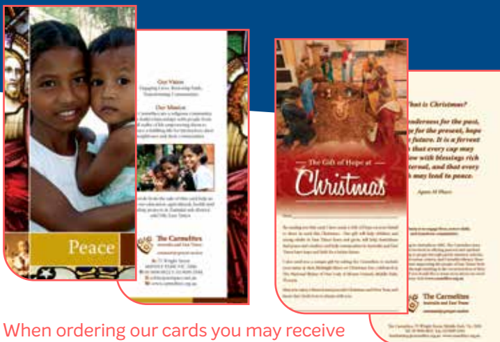
When ordering our cards you may receive images different to those shown here.

When you buy our cards, you’re helping us serve communities in Australia and Timor-Leste. To order your cards complete the form, call 03 9690 8822 or email fundraising@carmelites.org.au